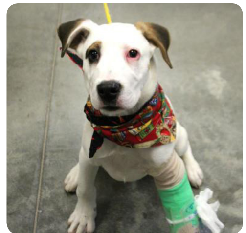
Adonis is a 6-month-old puppy that was found abandoned in a ditch with a broken leg. LCHS gave him the medical care needed to live a long and healthy life with a loving adoptive family.

The Licking County Humane Society seeks to improve the lives of animals and their people through advocacy, education, and support.